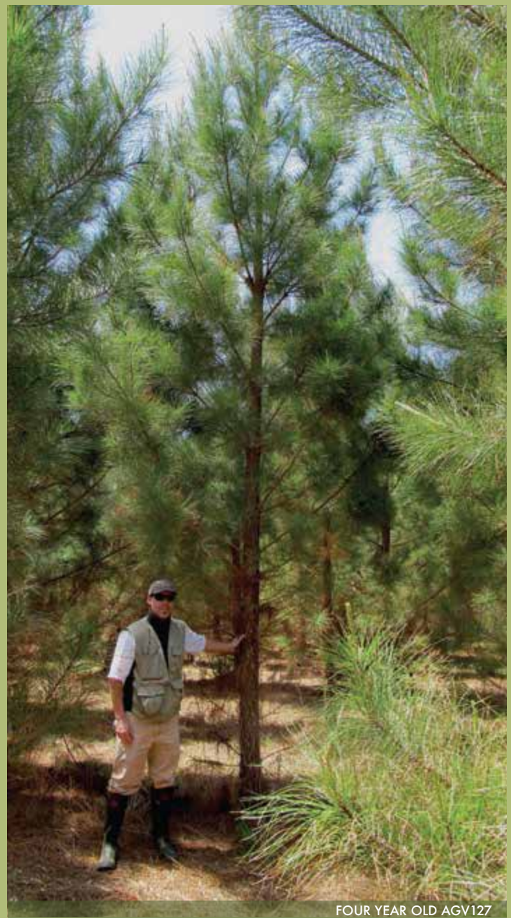
FOUR YEAR OLD AGV127

Our Varietal SuperTree Seedlings® are selected for fast growth, disease resistance, log straightness, reduced forking and efficient crown structure. Each Varietal is a genetic replica providing the greatest degree of stand uniformity yielding the highest number of crop trees per acre and thus the highest value per acre of all ArborGen products. Only the top 1% of all trees tested after 4-6 years will make the grade to become an ArborGen Varietal. Finally, most ArborGen Varietals undergo an additional level of review as their uniqueness is recognized by being awarded patent protection from the U.S. Patent Office. With appropriate silviculture, the landowner can expect both earlier thinning and final harvest ages as well as significant increases in the volume of sawtimber grade logs per acre. Varietal stands will also have a much higher number of pole trees per acre with slightly longer crop rotations. Our Varietals can be planted in pure blocks or in FlexStands® depending on landowners objectives. By planting and actively managing ArborGen Varietals, the landowner can expect increases in value of 80-100%, increases in revenue of 50% to 75% and rates of return from 11-16% over traditional seedlings.