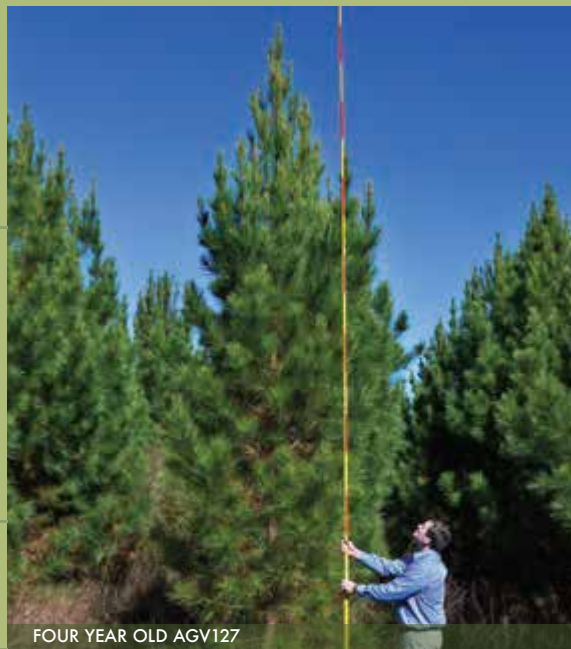
FOUR YEAR OLD AGV127