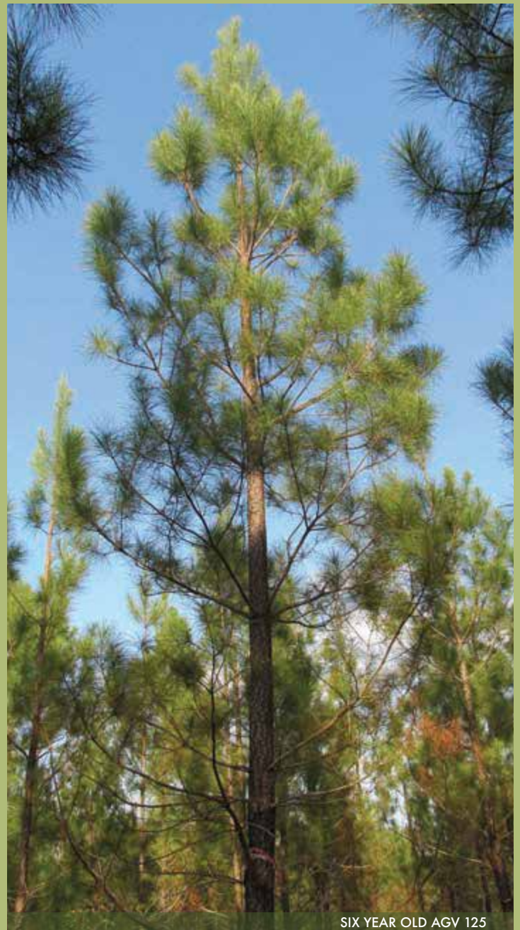
SIX YEAR OLD AGV 125

Our Varietal SuperTree Seedlings® are selected for fast growth, disease resistance, log straightness, reduced forking and efficient crown structure. Each Varietal is a genetic replica providing the greatest degree of stand uniformity yielding the highest number of crop trees per acre and thus the highest value per acre of all ArborGen products. Only the top 1% of all trees tested after 4-6 years will make the grade to become an ArborGen Varietal. Finally, most ArborGen Varietals undergo an additional level of review as their uniqueness is recognized by being awarded patent protection from the U.S. Patent Office. With appropriate silviculture, the landowner can expect both earlier thinning and final harvest ages as well as significant increases in the volume of sawtimber grade logs per acre. Varietal stands will also have a much higher number of pole trees per acre with slightly longer crop rotations. Our Varietals can be planted in pure blocks or in FlexStands® depending on landowners objectives. By planting and actively managing ArborGen Varietals, the landowner can expect increases in value of 80-100%, increases in revenue of 50% to 75% and rates of return from 11-16% over traditional seedlings.