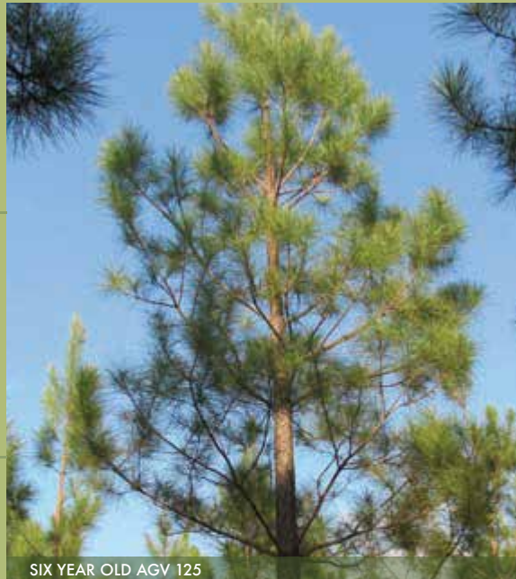
SIX YEAR OLD AGV 125