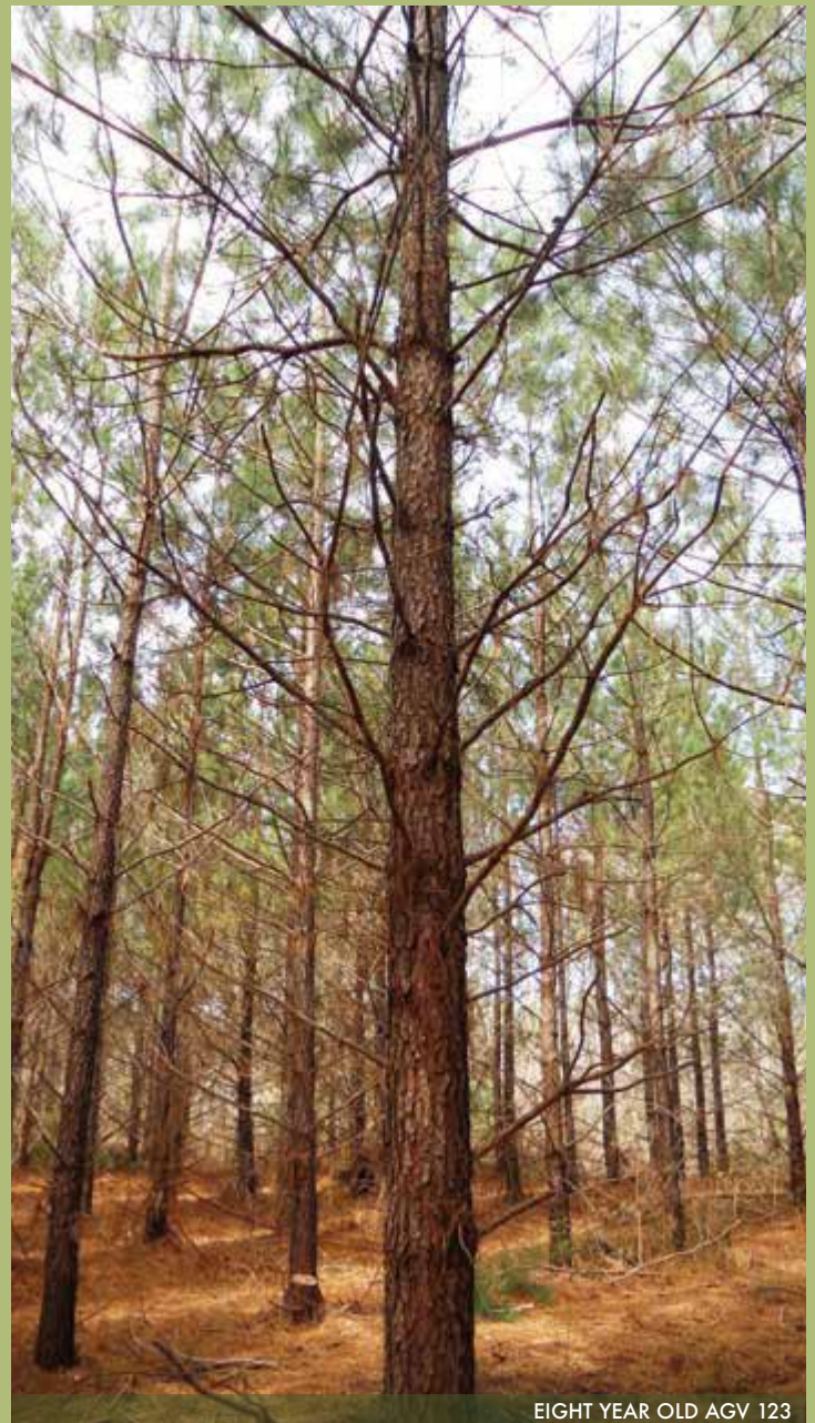
EIGHT YEAR OLD AGV 123

Our Varietal SuperTree Seedlings ® are selected for fast growth, disease resistance, log straightness, reduced forking and efficient crown structure. Each Varietal is a genetic replica providing the greatest degree of stand uniformity yielding the highest number of crop trees per acre and thus the highest value per acre of all ArborGen products. Only the top 1% of all trees tested after 4-6 years will make the grade to become an ArborGen Varietal. Finally, most ArborGen Varietals undergo an additional level of review as their uniqueness is recognized by being awarded patent protection from the U.S. Patent Office. With appropriate silviculture, the landowner can expect both earlier thinning and final harvest ages as well as significant increases in the volume of sawtimber grade logs per acre. Varietal stands will also have a much higher number of pole trees per acre with slightly longer crop rotations. Our Varietals can be planted in pure blocks or in FlexStands ® depending on landowners objectives. By planting and actively managing ArborGen Varietals, the landowner can expect increases in value of 80-100%, increases in revenue of 50% to 75% and rates of return from 11-16% over traditional seedlings.