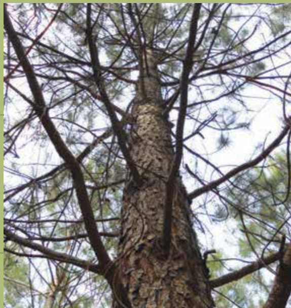
EIGHT YEAR OLD AGV 123