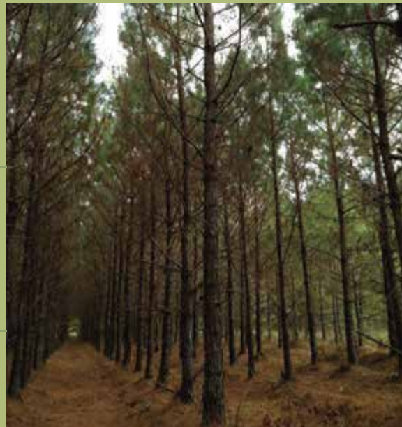
11 YEAR OLD AGV 126 IN ANGELINA COUNTY, TX